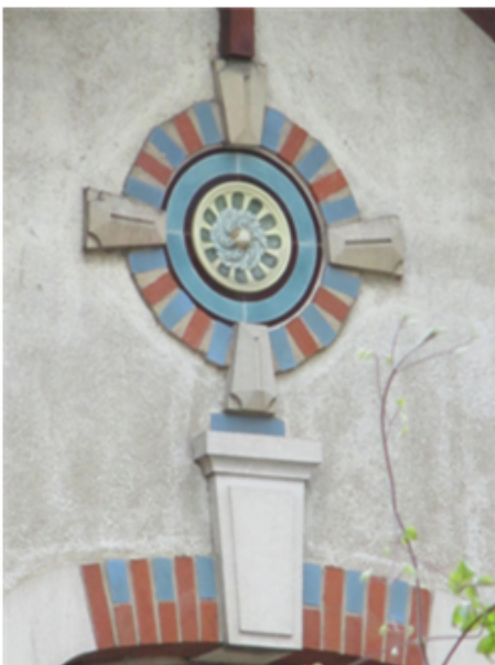
Decorative glazed bricks from Ecuisses.