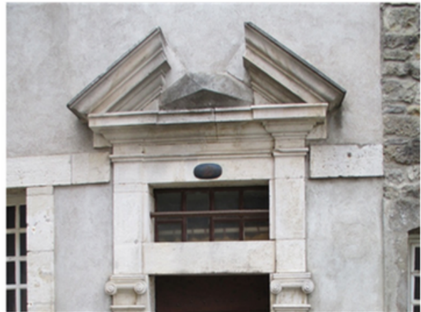
Renaissance house of the lawyer of the Abbess of Autun