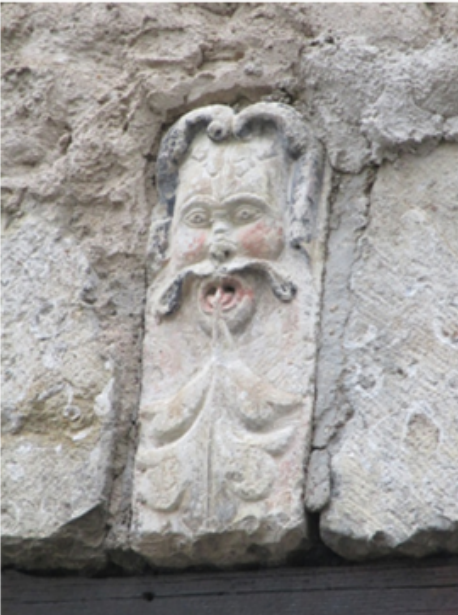
A grotesque mask that blows the evil spirit out of this medieval shop.