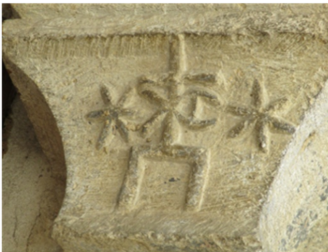
Emblem of the furriers: a press for the skins and a pair of pliers.